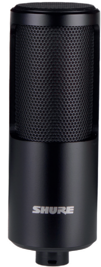
SM4-K Home Recording Microphone